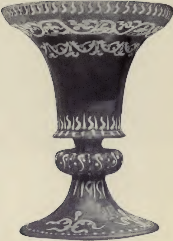
POKAL, OR GOBLET Barcelona Late Seventeenth Century